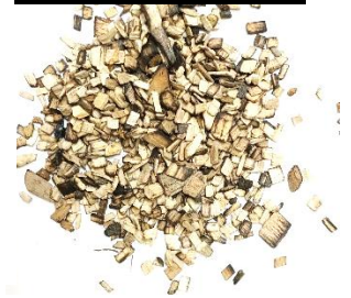
Small Wood Chips

Note: - Take extra care to minimise dropping any of the chipping in the gap / Glass retaining channel at the front of the fire.