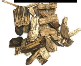
Large Wood Chips

Carefully add the "Small wood chips" (19) around the edges of the fuel bed.